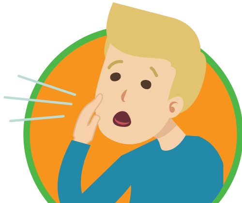
COUGH OR COLD